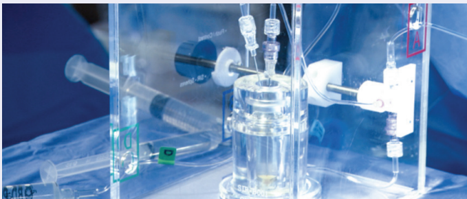
Image of a container of SIR-Spheres microspheres. The microspheres are less than a third of the thickness of a human hair in size.

SIR-Spheres microspheres are the tiny radioactive resin microspheres that are most commonly used in the SIRT procedure. Each microsphere has a radioactive substance called yttrium-90 (Y-90) attached to it.