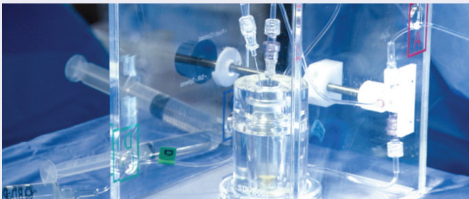
Image of a container of SIR-Spheres microspheres. The microspheres are less than a third of the thickness of a human hair in size.

SIR-Spheres microspheres are the tiny radioactive resin microspheres that are most commonly used in the SIRT procedure. Each microsphere has a radioactive substance called yttrium-90 (Y-90) attached to it.